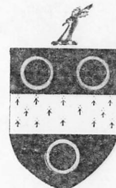
Underwood of Ireland