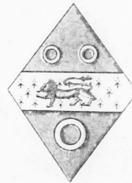
Duchess of Inverness