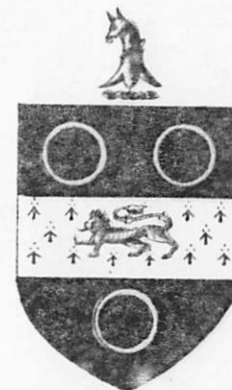
Underwood of Hereford